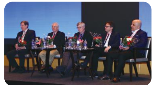
The international faculty