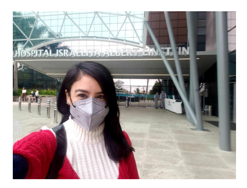
Hospital Israelita Albert Einstein hospitalization and procedures in headache