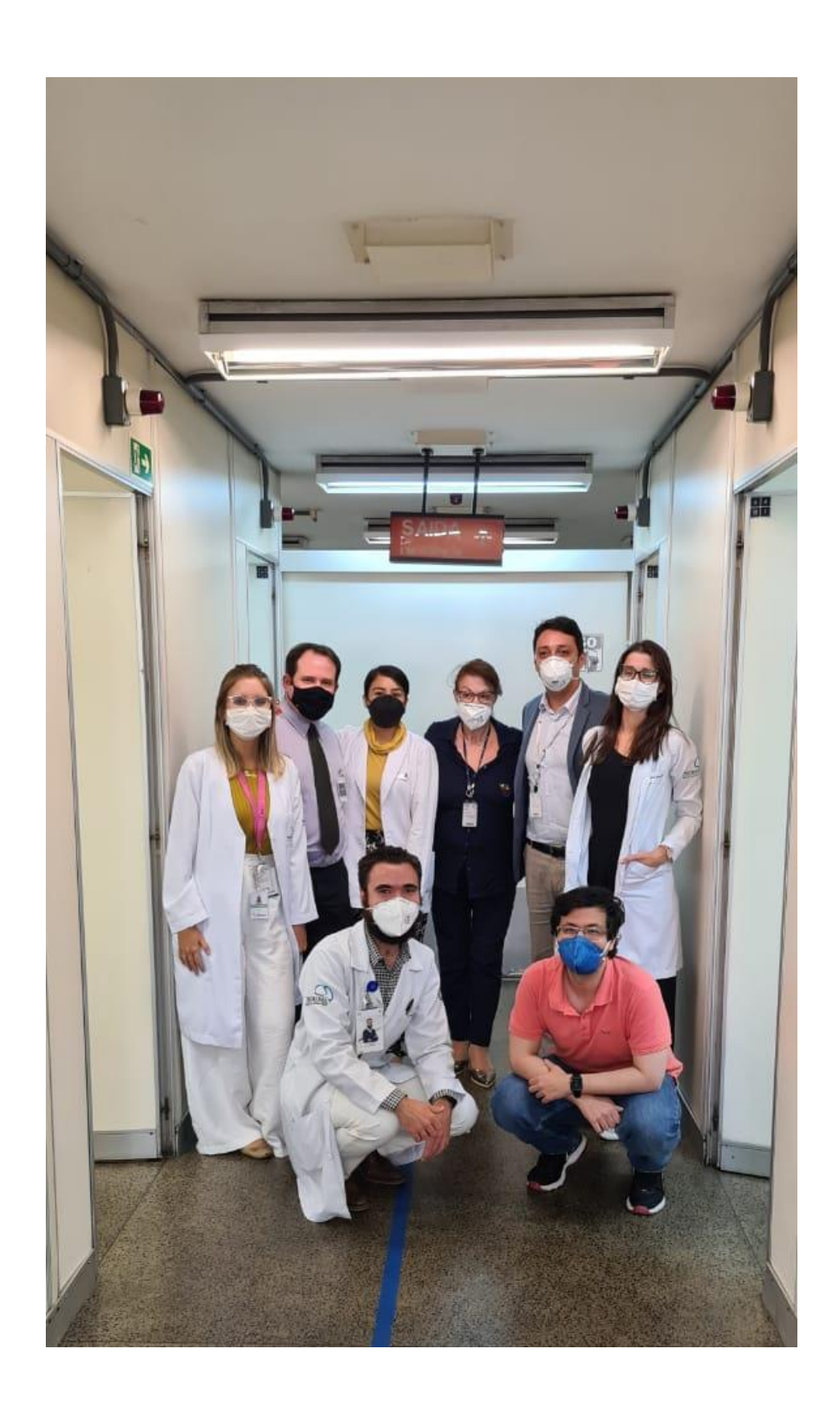
Team Fellow Headache "Hospital de las Clínicas", São Paulo University Outpatient consult public health system