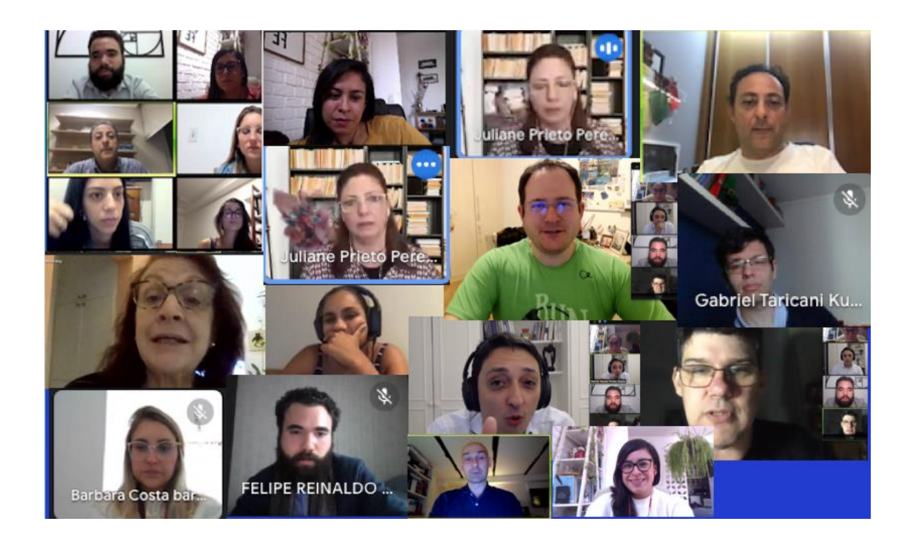
Virtual meetings during the COVID - 19 pandemic