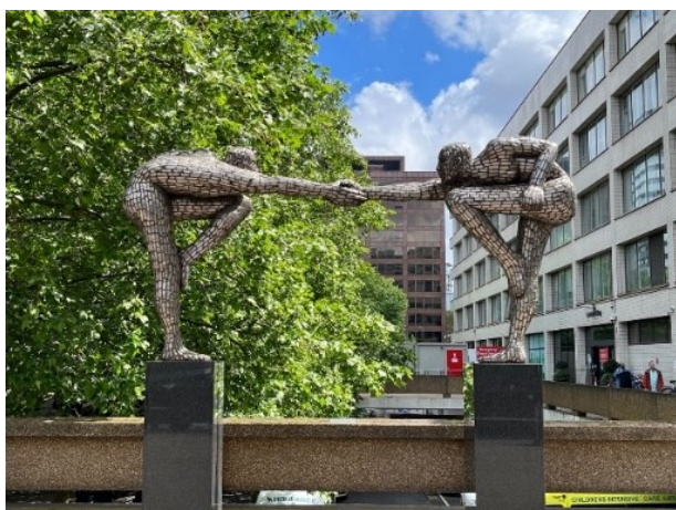
"Cross the Divide" (2000), sculpture at the St Thomas' Hospital entrance